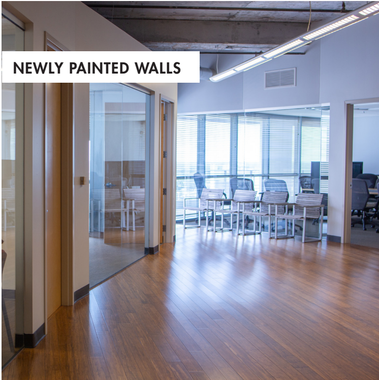
NEWLY PAINTED WALLS