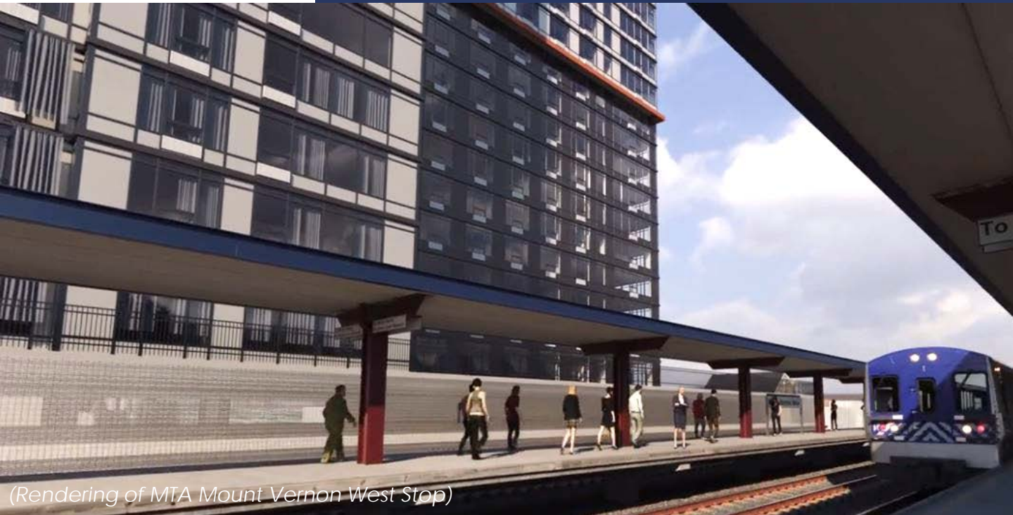
(Rendering of MTA Mount Vernon West Stop)