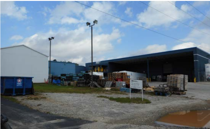
REAR COVERED LOADING