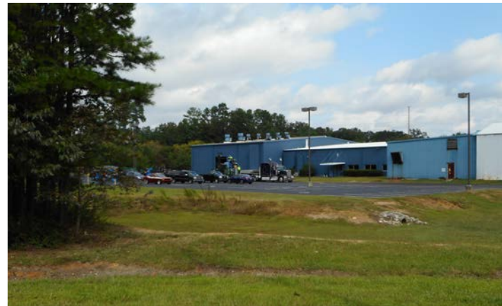
REAR HEAT TREATMENT ROOM EXTERIOR