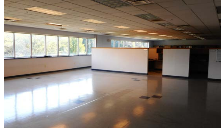
UPSTAIRS OPEN OFFICE