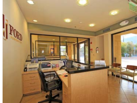
Main Entrance First Floor Offices