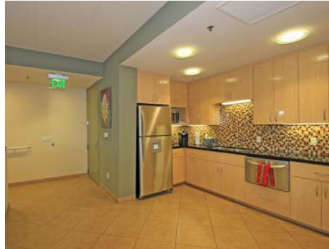
Second Floor Kitchen