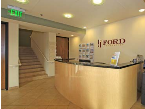
Main Entrance Front Desk

73141 Fred Waring Drive, Palm Desert, CA