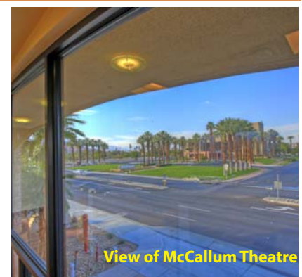
View of McCallum Theatre