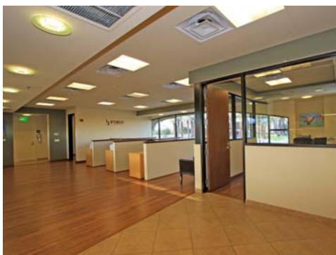
Second Floor Office and Open Space