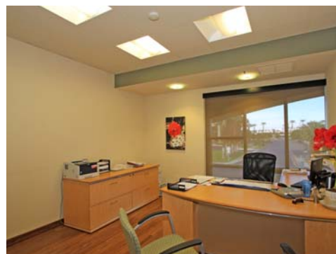
Second Floor Office